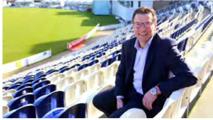
Rob Andrew - Chief Executive, Sussex Cricket

An extraordinary year in 2021 for the Sussex Cricket Foundation and all who work so hard to promote cricket across all our communities in the county.