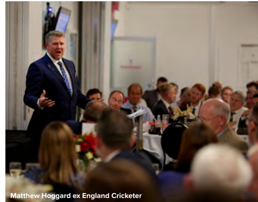
Matthew Hoggard ex England Cricketer