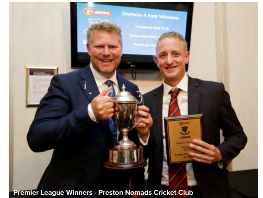
Premier League Winners - Preston Nomads Cricket Club